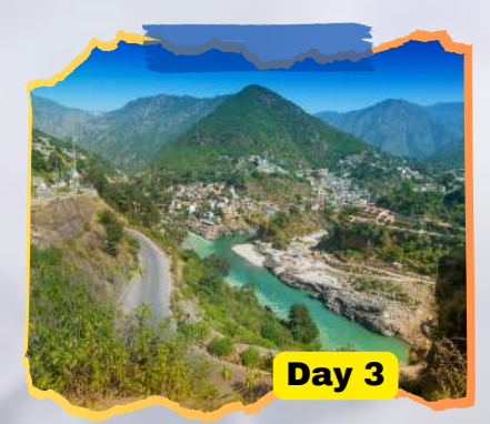
Haridwar to Sonprayag on the way Devprayag