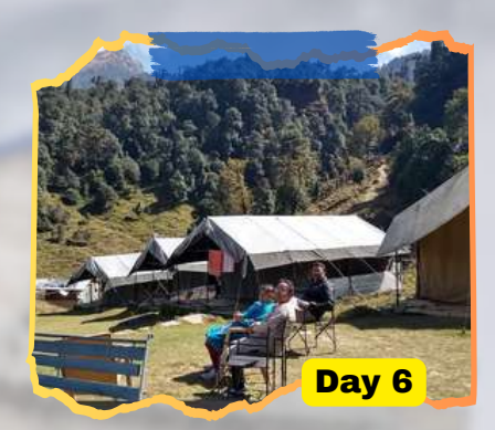
Guptkashi to Chopta Stay in Chopta