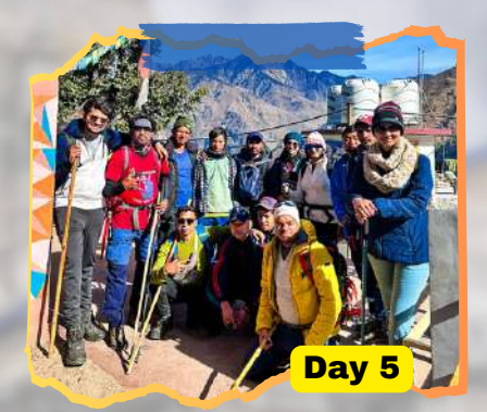
Kedarnath to Sonprayag Trek Stay in Guptkashi