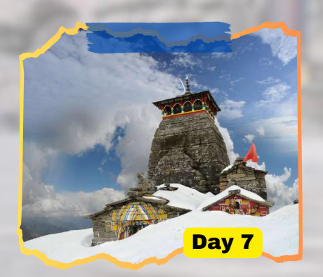
Early Morning Trek to Tunganath Return to Rishikesh