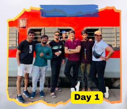
Starts Journey towards Delhi from Mumbai / Pune