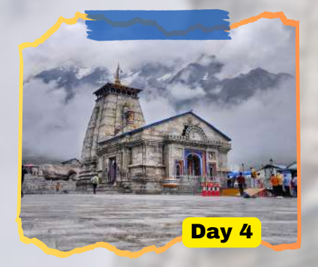
Kedarnath Trek & Darshan Stay near Kedarnath