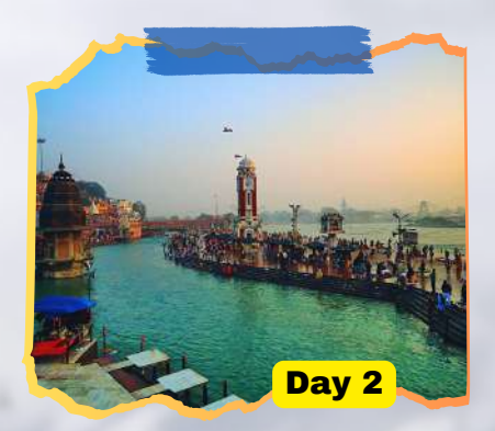
Reach Delhi / Journey towards Haridwar