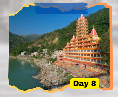
Rishikesh Adventure return journey to Delhi